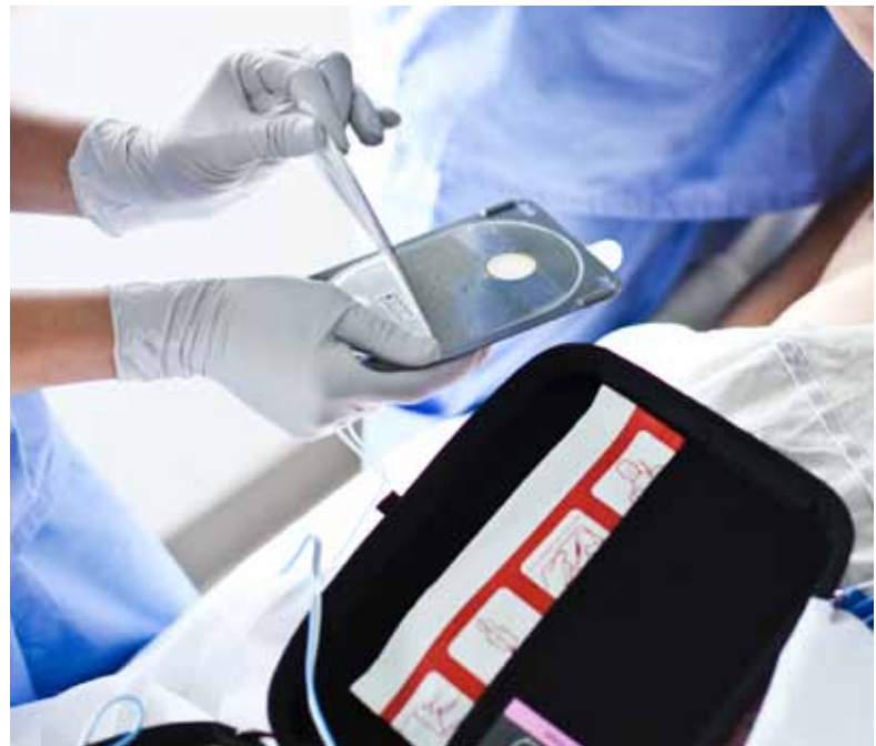
The HeartStart FR3 is the smallest and lightest professional-grade AED among the leading global manufacturers.